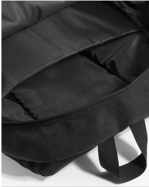
15" LAPTOP POCKET