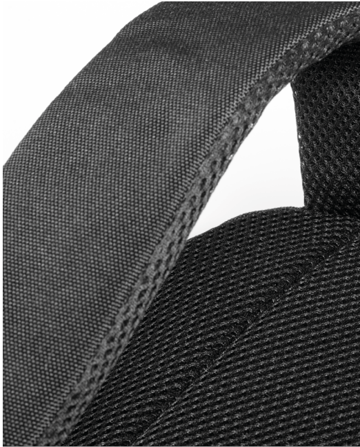
BREATHABLE BACK SYSTEM