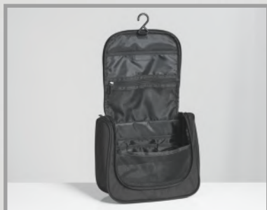
A SEWN-IN HOOK FOR CONVENIENCE