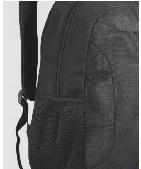
ADDITIONAL SIDE POCKETS