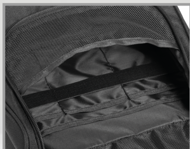
ROOMY MAIN COMPARTMENT